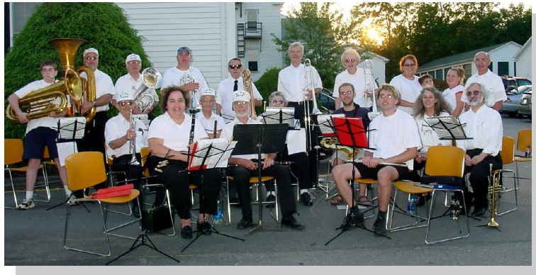
The R.B.Hall Memorial Band ~ Oakland Historical Society Ice Cream Social ~ Summer 2006